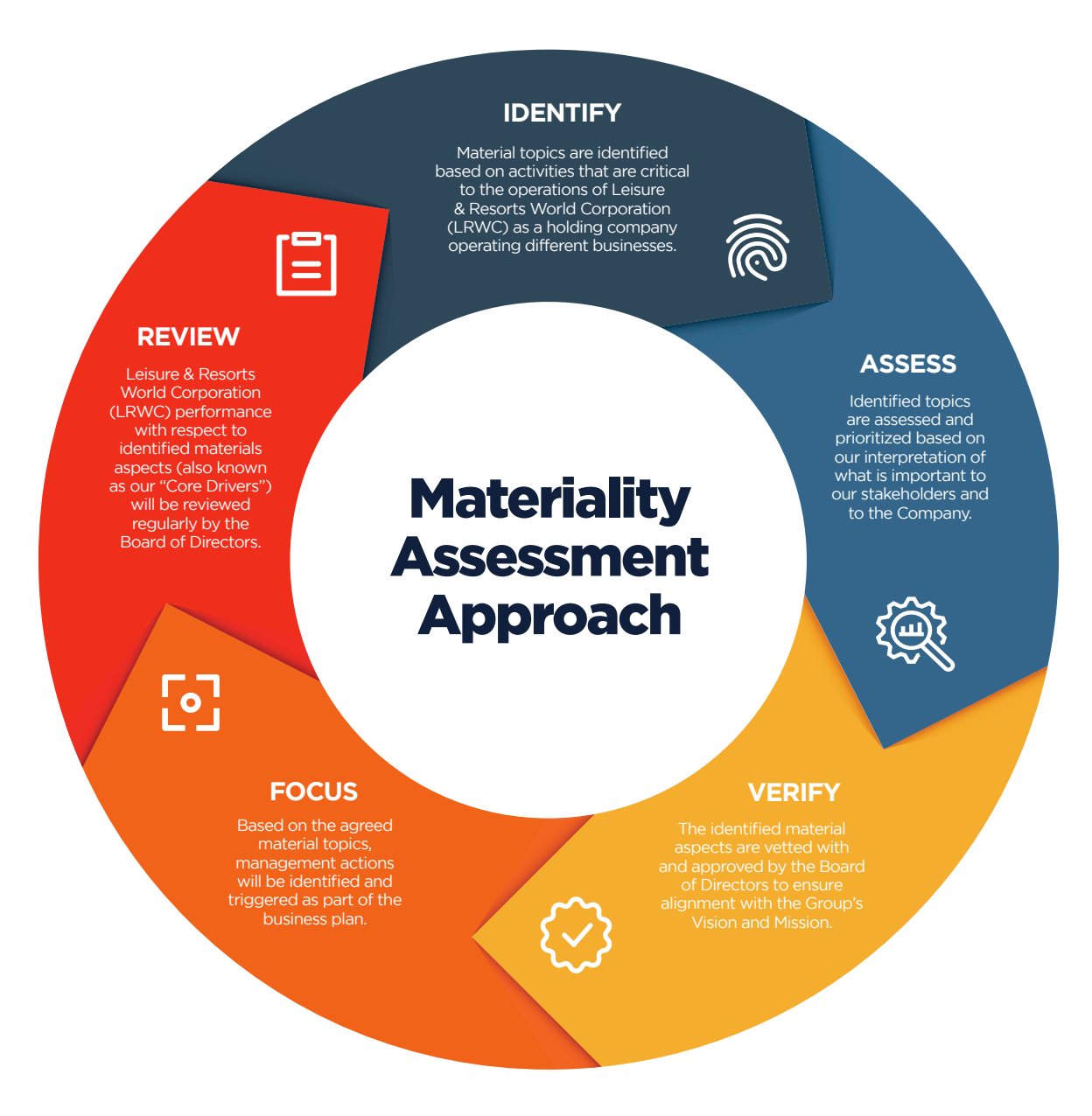
Figure 1 Materiality Assessment Approach

The Organization adopted the subsequent approach to identify material topics: